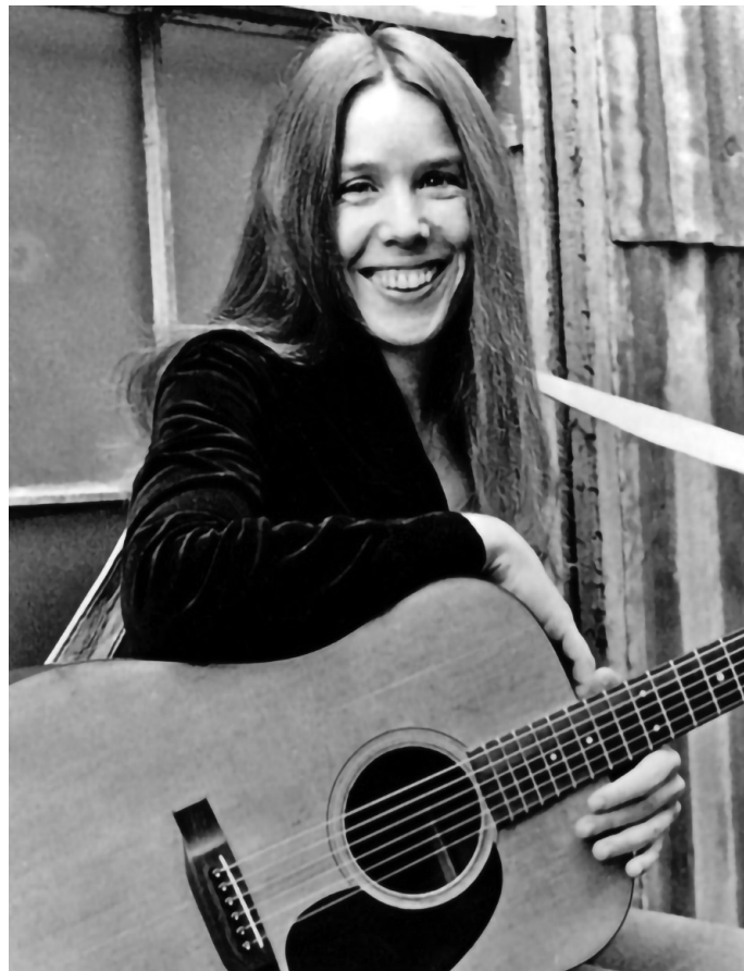
Kate Wolf