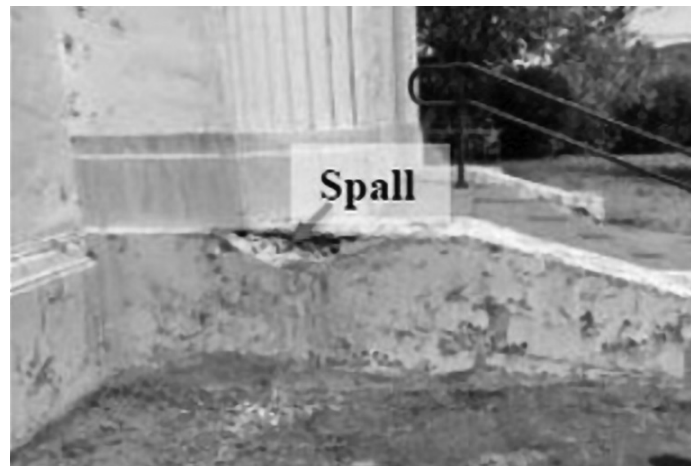
Example of the building's deterioration

In closing, I extend a heartfelt thank you to Sierra County's Public Works Department for their dedication