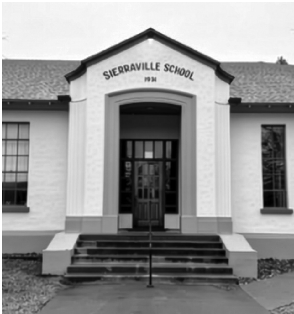
Sierraville School, post-restoration

Sierraville School Restoration (Continues on next page) ➔