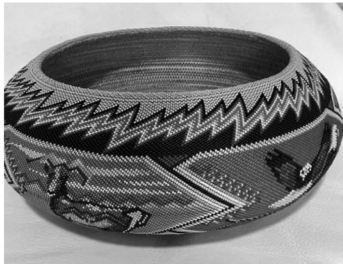
Basket depicting Great Basin animals