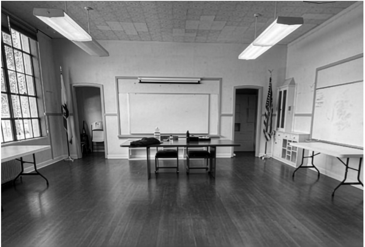
Restored floor, Amodei Room, Corri Jimenez Photo