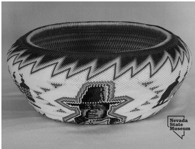
Wovoka basket, now on display in Carson City