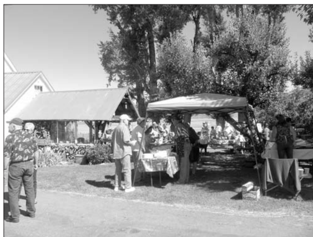
The beautiful Strang Ranch with its scenic vistas of Sierra Valley was the site for the annual meet and greet.