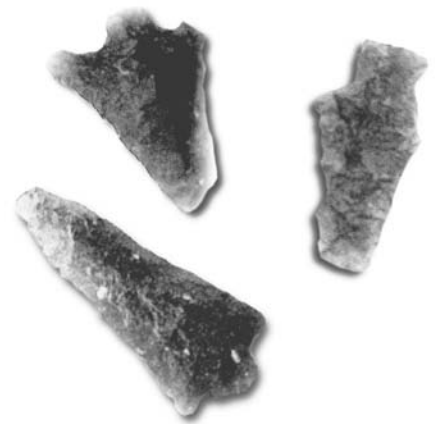
Projectile points found near Sattley.

bulbs during the months of June and July, as well as collecting acorns from the oak trees that were growing in the valley at that time. They hunted the plentiful waterfowl—deer, antelope, rabbit, and other game.