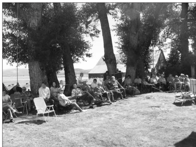
Barbeque and all the "fixins" was enjoyed by the large group attending the annual meeting.