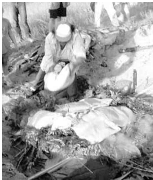
Camas Roasting in Rock-lined Oven.

collected from the features produced radiocarbon dates between 1,000 and 500 years ago.