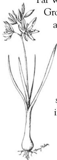
Camas Plant ( Camissia quamash )

This 1999-2002 excavation project, located in the northern region of the valley, was conducted by Far Western Anthropological Research Group, Inc., a cultural resource management group contracting with CalTrans. The excavation resulted in the discovery of 57 cultural features including large and small stone-lined cooking pits; clusters of unburnt stones; small rock pavements; two superimposed house floors with central hearths; bone-tool manufacturing debris; milling tools; and other features that couldn't be positively identified because of disturbance.